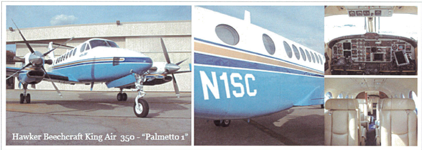
Hawker Beechcraft King Air 350 - "Palmetto 1"