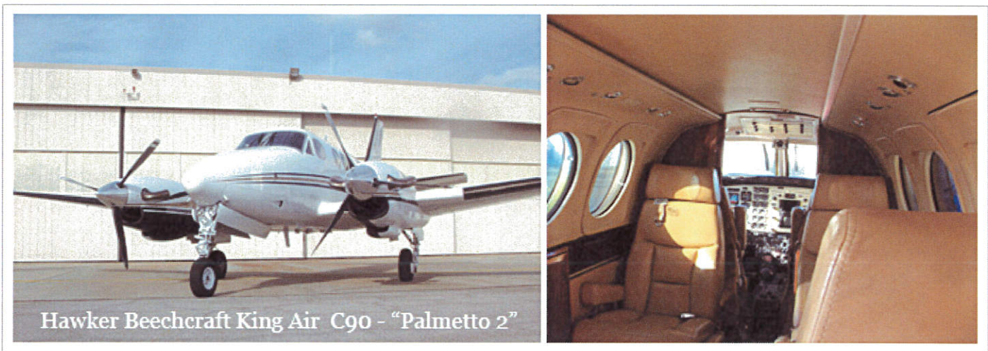
Hawker Beechcraft King Air C90 - "Palmetto 2"

According to commission staff, the fleet of aircraft managed by aeronautics should include a utility class aircraft. This aircraft could be used by Airport Development staff to survey airports, and to transport staff to and from the state's public use airports. This aircraft could also be used to transport other state agency staff members whose transportation needs may not justify the use of the larger state planes.